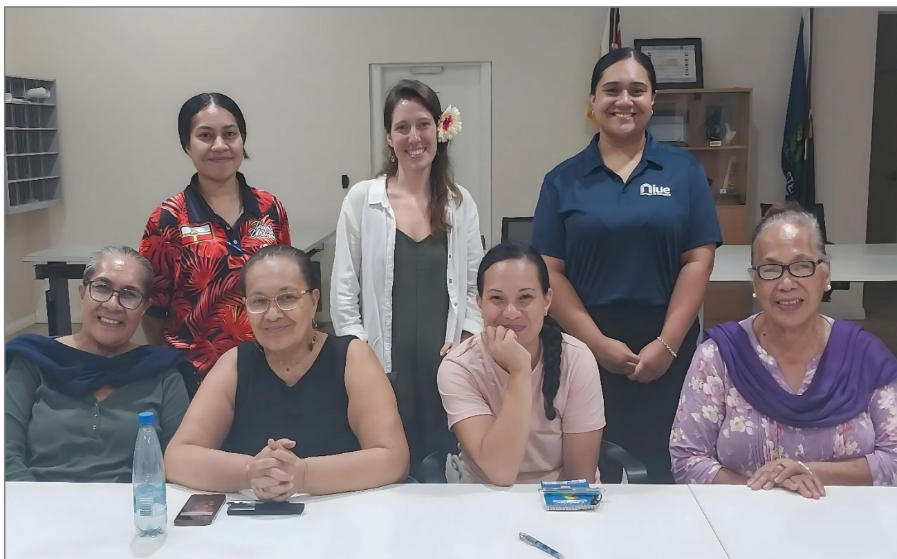
September 17 2024 – Women Focus Group - Blue Economy Strategy for Niue