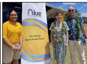
Tokelau Ambassador (left photos) and French Ambassadors (right photo) with team in the NCOC Exhibit

With every Show Day, Niueans reaffirm their connection to the land, celebrate their cultural legacy, and envision a prosperous future. The Niue Chamber of Commerce strives for sustainable growth for Niue's private sector going forward into another 50 years of self-governance.