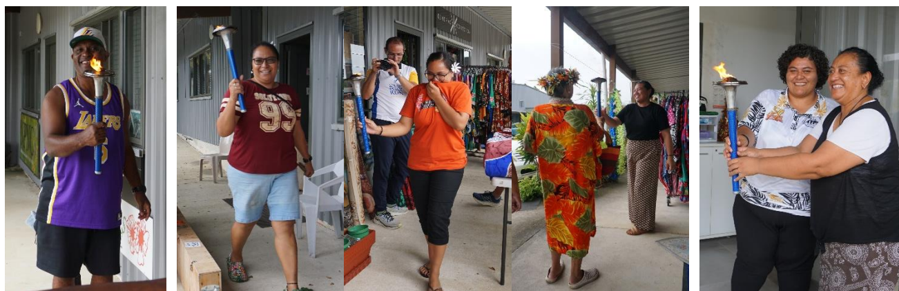
November 4 th 2024 – The Peace Batton being past around Businesses around Swansons Complex

The Peace Torch Batton made it to the Niue Chamber of Commerce & around the Swanson Complex to pass among the businesses. The Niue Chamber of Commerce is absolutely thrilled and grateful to also have received from the Sri Chinmoy Peace Run group a Certificate of Appreciation. Fakaauae lahi for visiting and bringing the peace run to our little business nook here at Fonuakula.