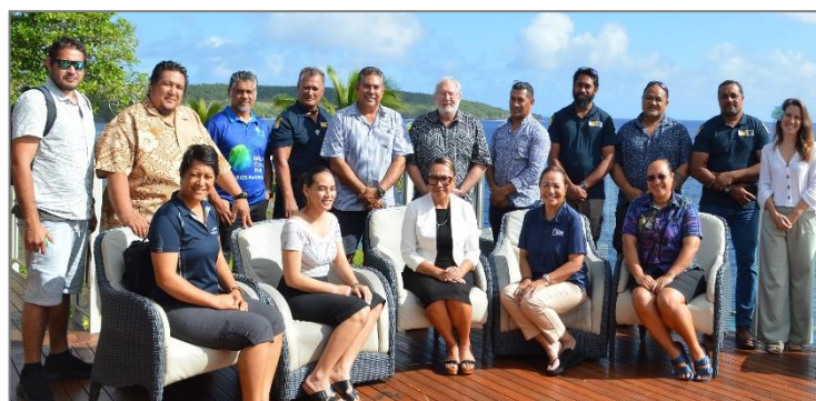
September 11 2024 – Inception Workshop Niue Integrated Ocean Management Strategy (NIOMS) Blue Economy Strategy for Niue.