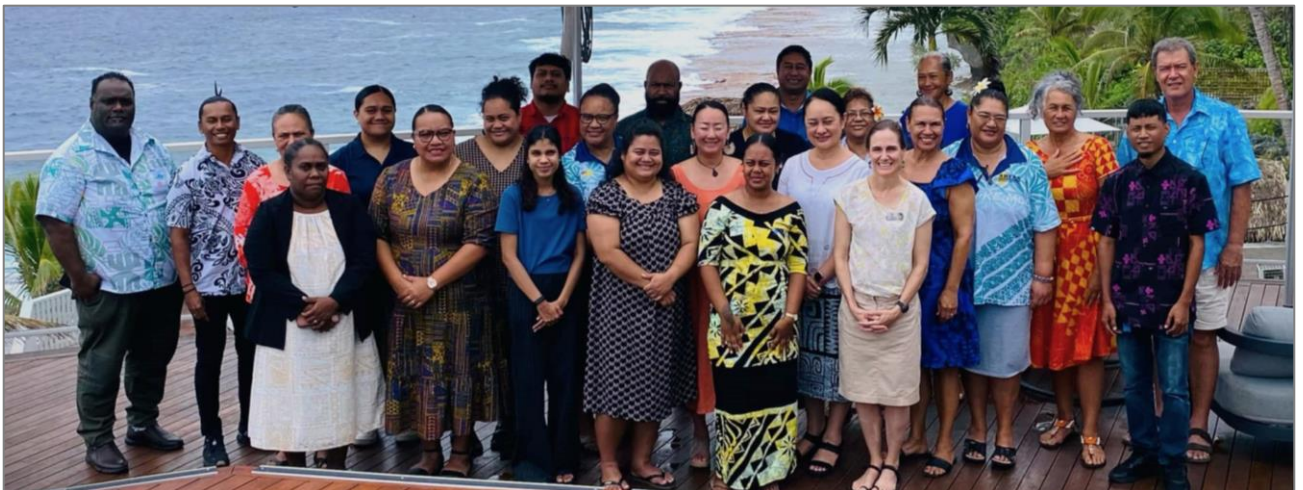
September 17 2024 – Pacific Regional Cohort Community of Practice Workshop Day 1