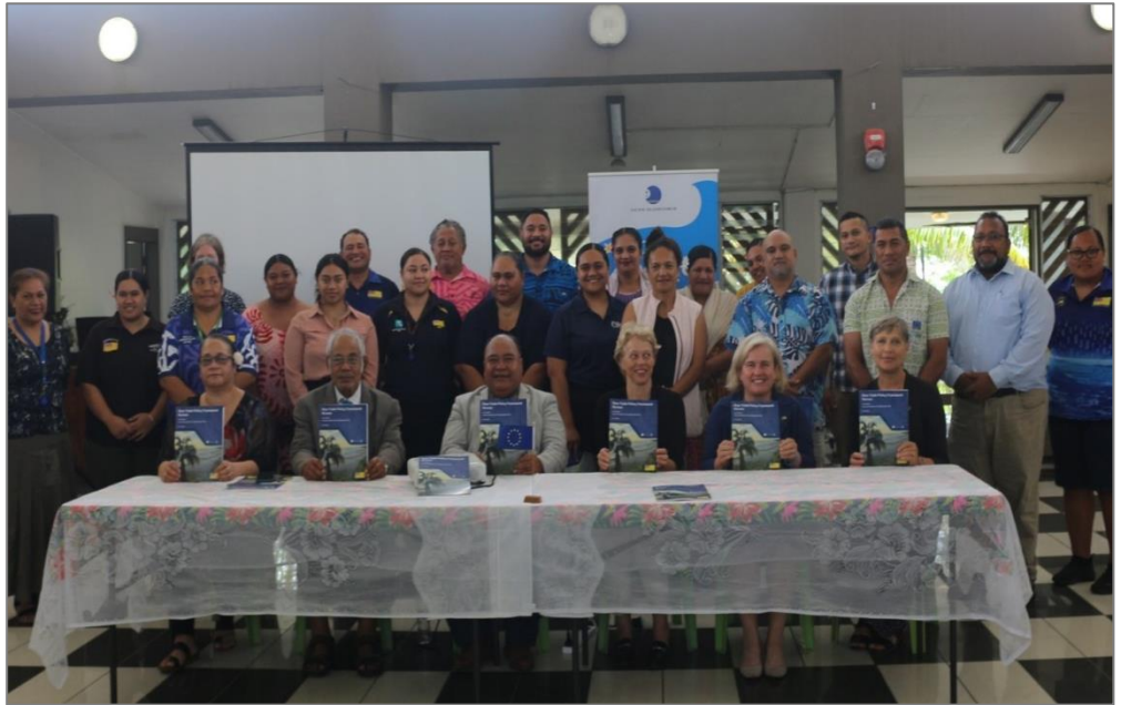
September 18 2024 – Niue Government & Stakeholders present at the Launch of Niue's Trade Policy Framework Review Report

The Trade Policy Framework Review will make sure that Niue's trade policy is actively relevant, taking into account the significant global and trade changes that have occurred since 2016 as well as the Niuean government's current trade priorities.